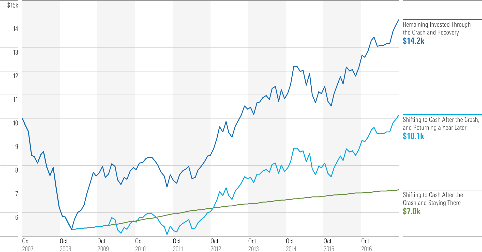
Ending Wealth Values After a Market Decline

The image shows three different reactions to a recent investment loss. The dark blue line shows the experience of an investor who stayed invested in stocks. The green line shows the experience of an investor who exited the stock market and invested in cash. And the light blue line shows the experience of the investor who exited the market at the bottom but then reinvested in stocks a short time (12 months) later.